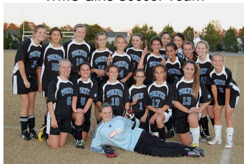
Northern Conference Co-champions