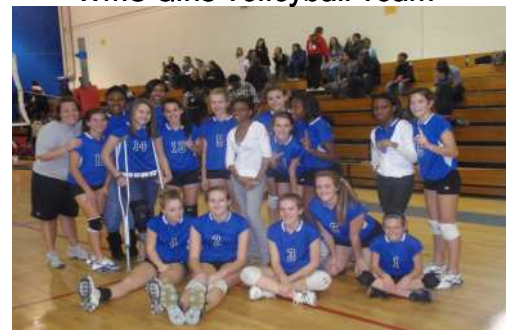
Northern Conference Champions